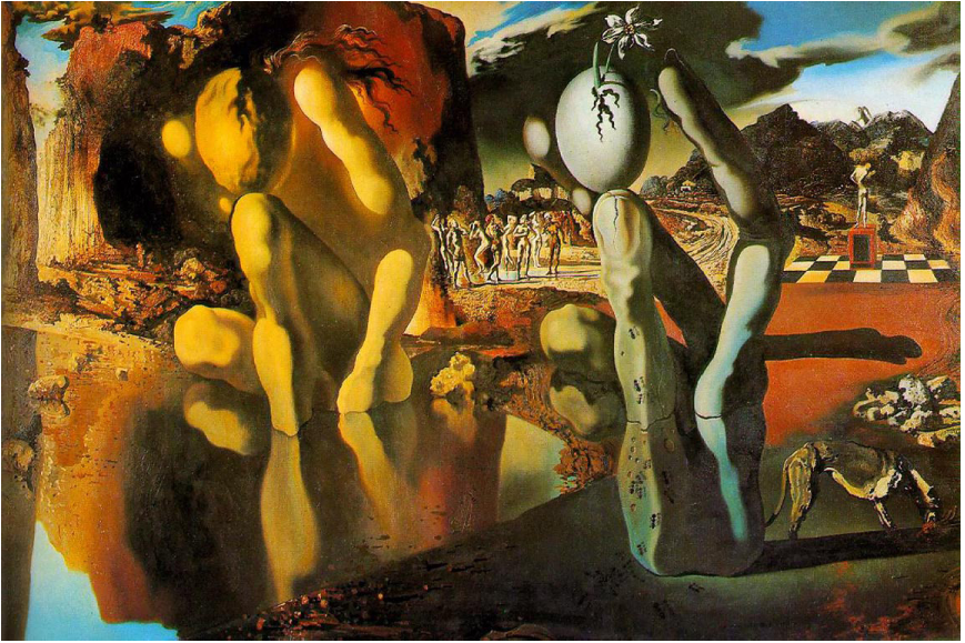
Salvador Dalí "Metamorphosis of Narcissus" Oil on Canvas, 1937